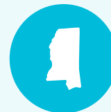
Mississippi HPV Cancer State Profile