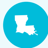
Louisiana HPV Cancer State Profile