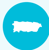
Puerto Rico HPV Cancer State Profile