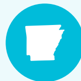
Arkansas HPV Cancer State Profile