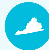
Virginia HPV Cancer State Profile