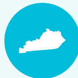
Kentucky HPV Cancer State Profile