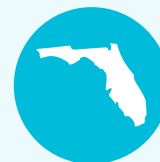
Florida HPV Cancer State Profile