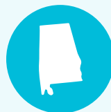
Alabama HPV Cancer State Profile