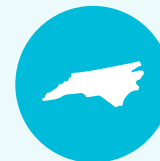
North Carolina HPV Cancer State Profile