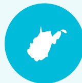
West Virginia HPV Cancer State Profile