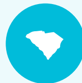
South Carolina HPV Cancer State Profile