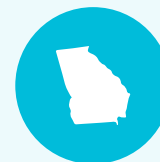
Georgia HPV Cancer State Profile